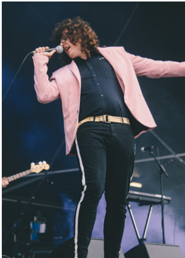
The Vegan Leather

W elcome to the MHF Live press release guide, which will take you through the key steps in promoting your event to the press. Included here is an example press release that you can adapt to suit your event, along with some helpful hints and tips on how best to distribute your press release. Let's get started!